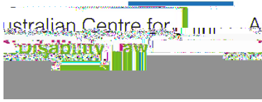
Australian Centre for Disability Law