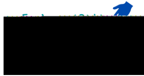
Employment Rights Legal Service