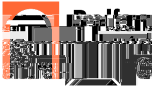
Redfern Legal Centre